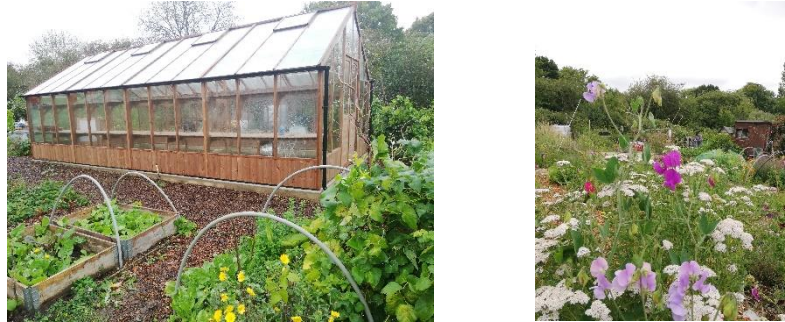
Burford Way Allotments - 'Ron's Plot' Community Allotment Garden

The green house / classroom in the photo below was funded in part by £10k last year from a Community Facilities Capital Grant.